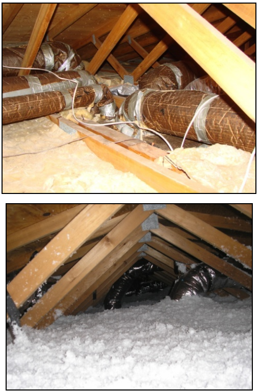
Figure 5 Typical attic insulation preretrofit (top) and post-retrofit (bottom)

In May of 2010, based in part on the field experience under this partnership, one encouraging result of this study has been the refinement of one partner's standard specifications for the retrofit activity under the second round of their Neighborhood Stabilization Program (NSP2) funding. The Sarasota Office of Housing and Community Development adopted energy conservation standards for their home rehabilitation projects under their NSP2 funding. Among the replacement standards are a 16 SEER air conditioner (as space allows), light or white colored roof and exterior, R-38 attic insulation, ENERGY STAR windows and appliances, 80% ENERGY STAR LED or CLFs or fluorescent light bulbs, and programmable thermostats. Further, they are