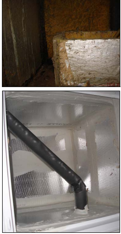
Figure 4 Typical building cavity used as a central return plenum (top) converted to a ducted return sealed with masti (bottom).

As discussed previously, gathering the actual costs after the renovation is complete has been challenging. This information is critical to