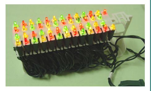
LED holiday lights